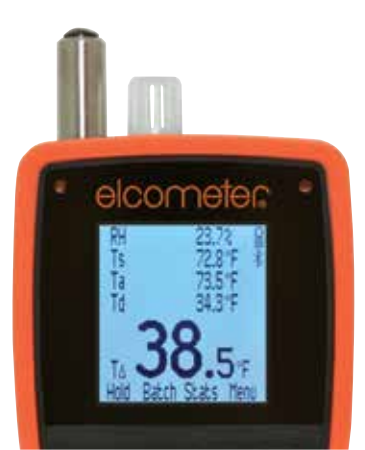
View up to 5 user selectable statistics on screen