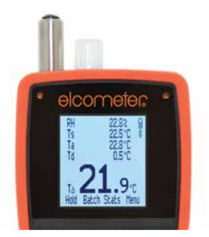
Large easy to read measurements in degrees °C or °F

BS 7079-B4, IMO MSC.215(82), IMO MSC.244(83), ISO 8502-4, US Navy NSI 009-32, US Navy PPI 63101-000