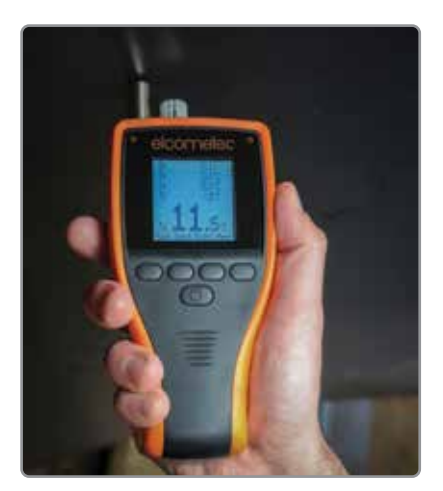
Dustproof and waterproof with fully sealed sensors

Connect the Elcometer 319 via Bluetooth® or USB to a PC, Android™ or iOS mobile device & download the data into an inspection application or into ElcoMaster® for instant report generation.