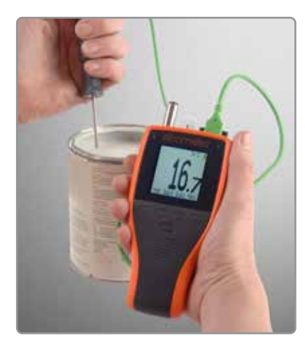
Te - Ideal for use as a simple thermometer