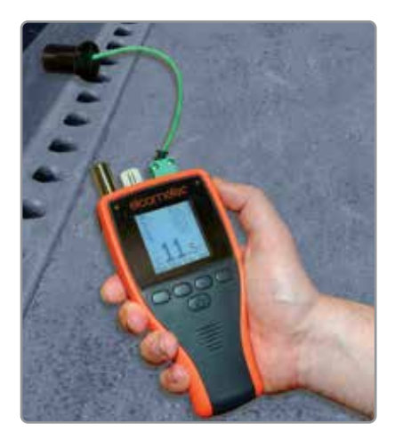
Easy to use with an intuitive menu structure