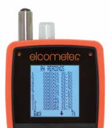
Review individual readings