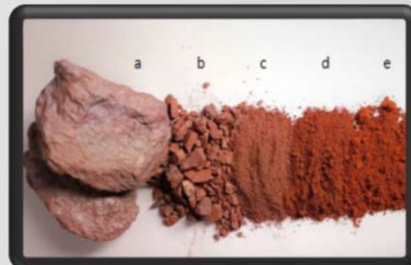
Natural Dye Non-stainable dye